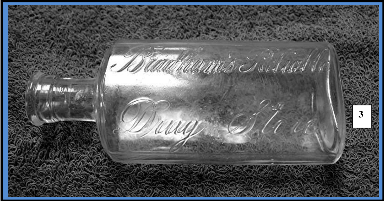
BRADHAM'S RELIABLE DRUG STORE