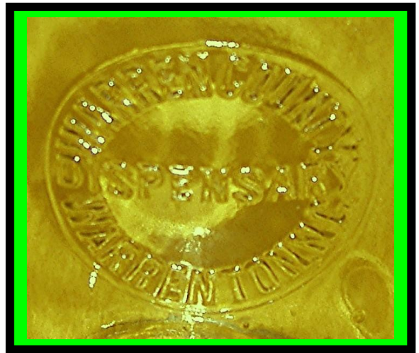
This is a nice, slug plate, pint Warren County Dispensary from Warrenton, N.C.