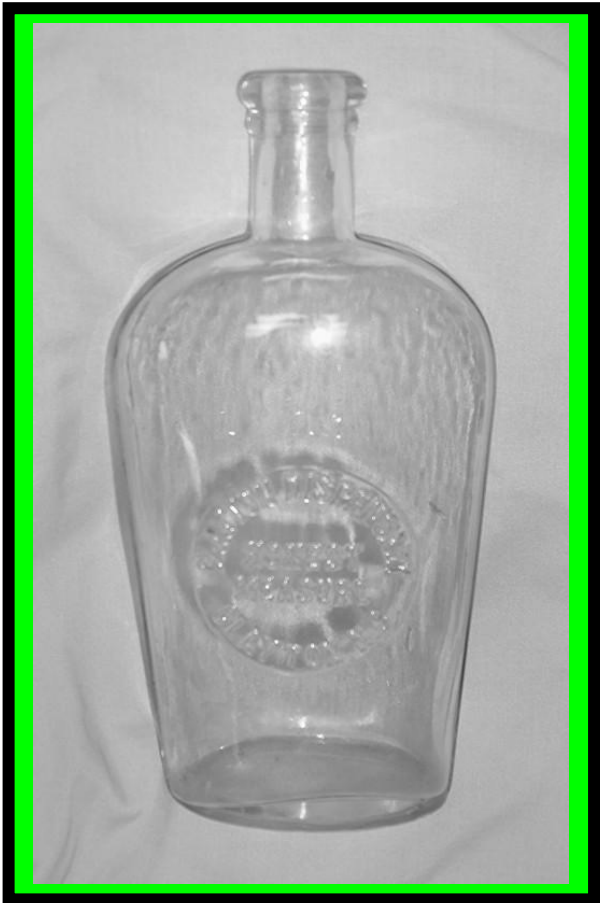
The bottle on the right is a pint HONEST MEASURE CLAYTON DISPENSARY bottle from CLAYTON, N.C.