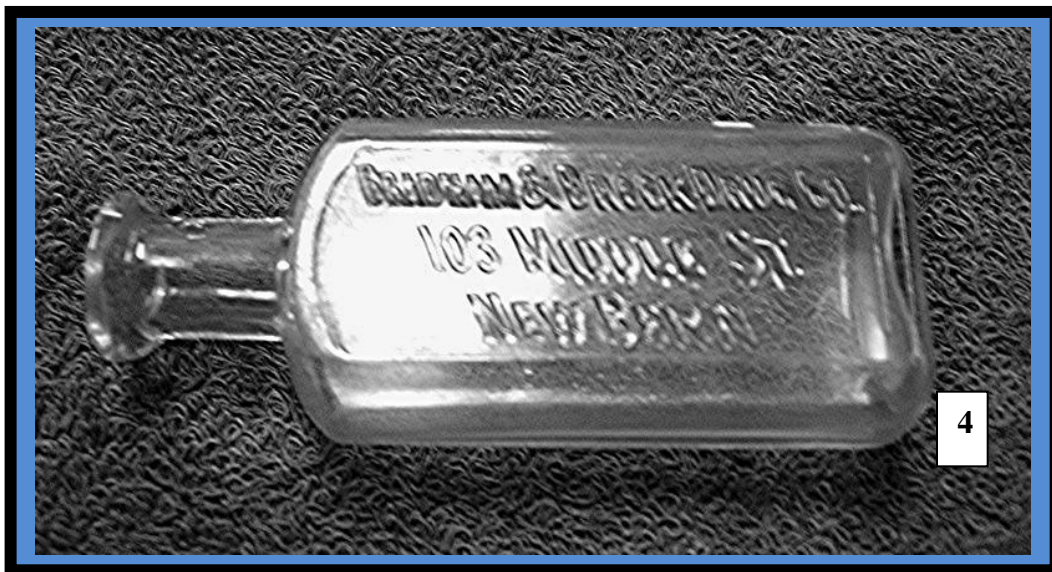
BRADHAM AND BROCK DRUG CO. 103 Middle Street, New Bern