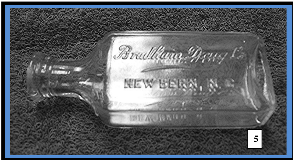
BRADHAM DRUG CO. NEW BERN, N.C.