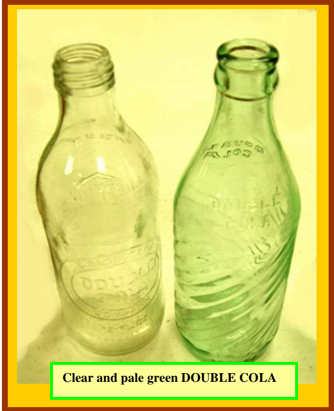
Clear and pale green DOUBLE COLA