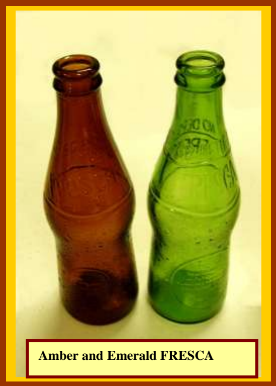
Amber and Emerald FRESCA