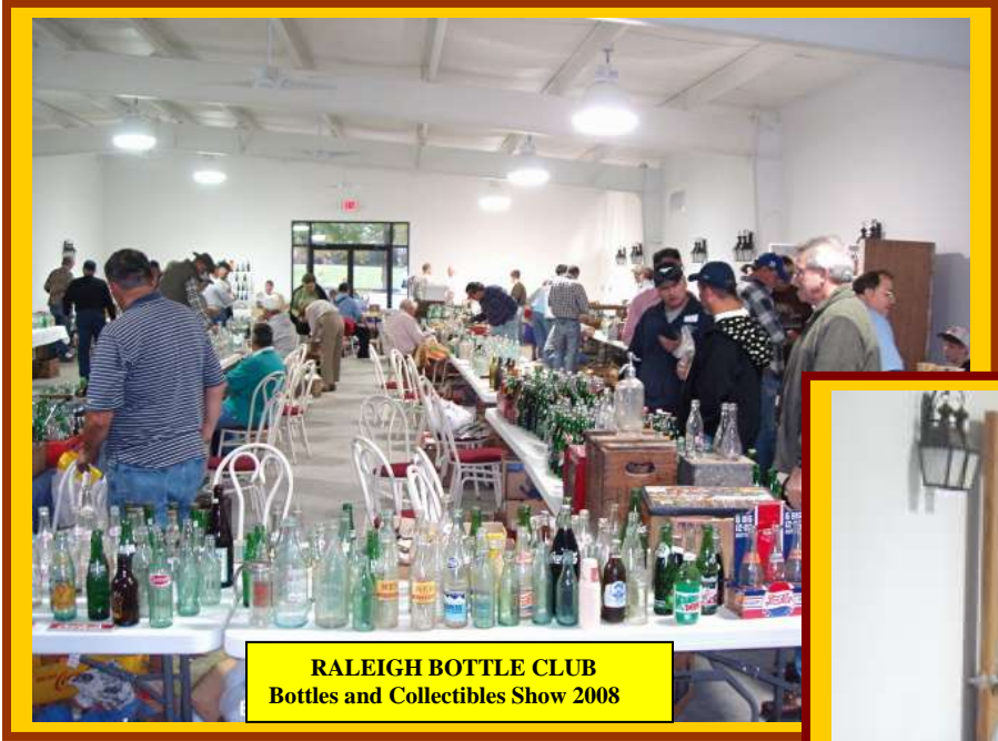
RALEIGH BOTTLE CLUB Bottles and Collectibles Show 2008