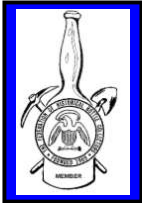
Raleigh Bottle Club, FOHBC Member