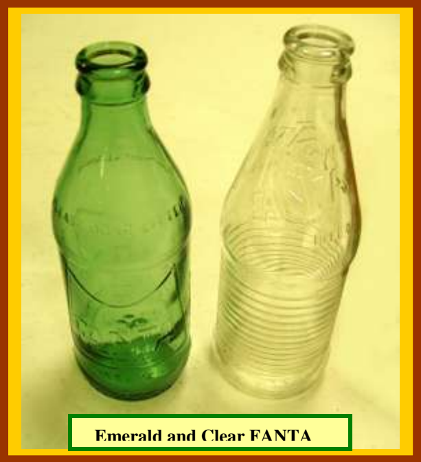
Emerald and Clear FANTA